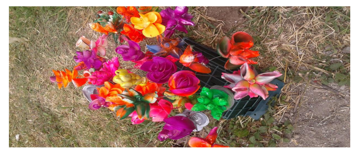
Decorations from seashells