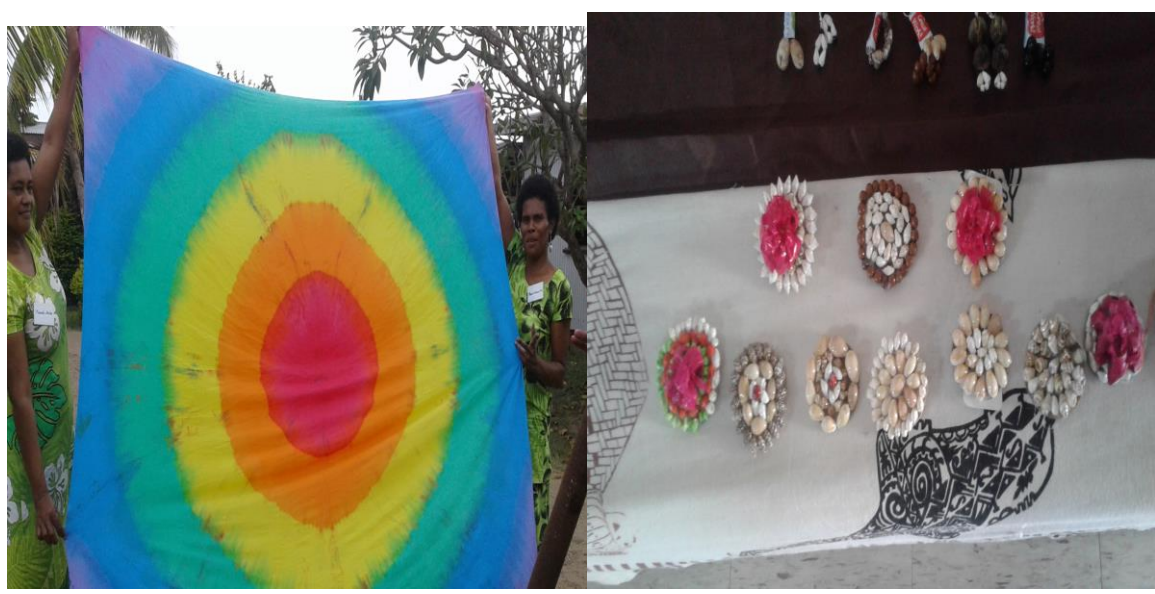
Tie and dye, screen printing and Jewellery on display