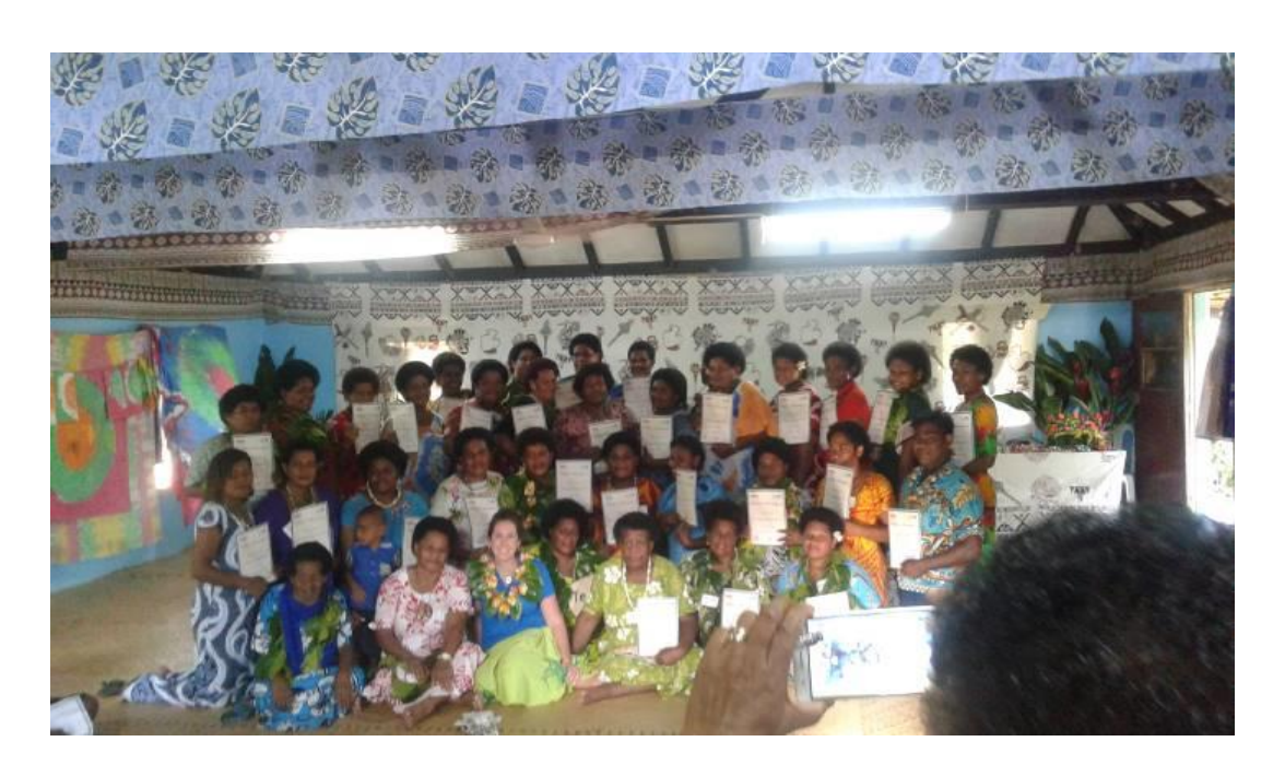
Sansana Women with their Certificates

REPORT FOR PROFESSIONAL GOLFERS ASSOCIATION [PGA]