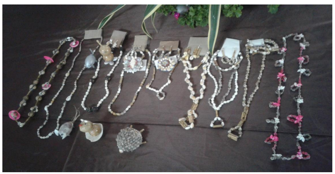
Jewellery making products