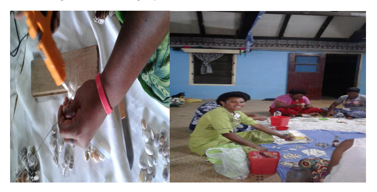
Women praticing new skills

The main target group were the women (20 years-50 years old) of Sanasana village including women that are currently selling handcraft on daily basis. 38 Participants took part in the 5 days' workshop at the community hall and night classes were available to those women who were working at the hotel during daytime.